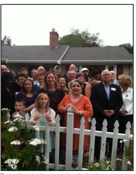
Revealing the home at the dedication ceremony.