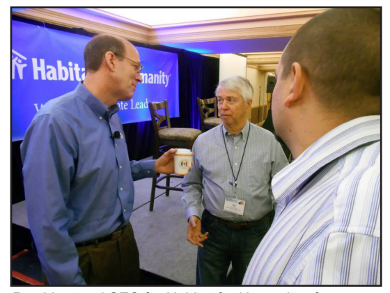
President and CEO for Habitat for Humanity of Jacksonville, Inc opened the conference updating all affiliates on our new strategic plan.

The Summit kicked off with a bus tour of the New Town neighborhood before officially commencing with an informative general session and lunch. Affiliate leaders had the opportunity to review the recently completed Strategic Plan together before breaking into a series of smaller sessions. Our Affiliate leadership had the opportunity to learn about topics such as the changing mortgage laws, Board of Directors succession planning, and other key topics crucial to running an efficient Affiliate and serving our communities.